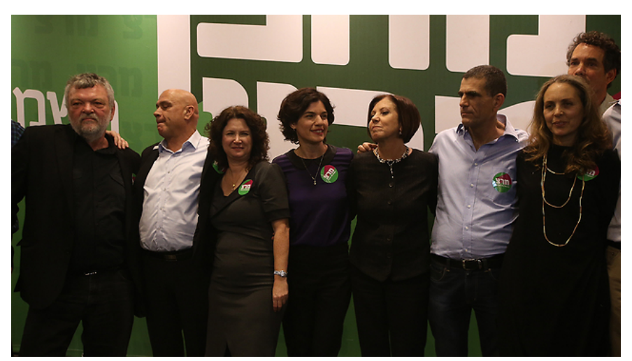
Meretz. 'The only Jewish party which renounces the settlements without stammering and without apologizing'

spray-paint mosques while F-35 stealth fighters, a gift from America, shield them from the sky. In other words, a government with the Zionist camp is like oxygen for the settlement enterprise: In the settlers' eyes, it's a step towards redemption; in my eyes, it's the biggest catastrophe the Jewish people have brought upon themselves.